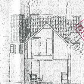
PROPOSED SECTION (THRU TWO STOREY EXT) 1:100

THIS COPY WAS MADE FROM THE ORIGINAL DRAWING. IT IS NOT TO BE USED FOR CONSTRUCTION WITHOUT THE PERMISSION OF THE ARCHITECT. ANY REVISIONS TO THE ORIGINAL DRAWING MUST BE APPROVED BY THE ARCHITECT.